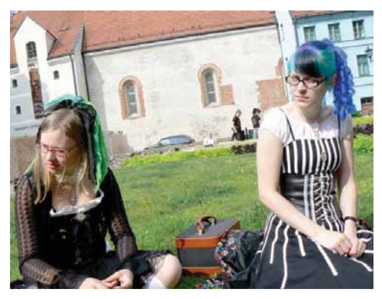
Pict. 11. Lolita Tea Party, 2008, Riga, Latvia