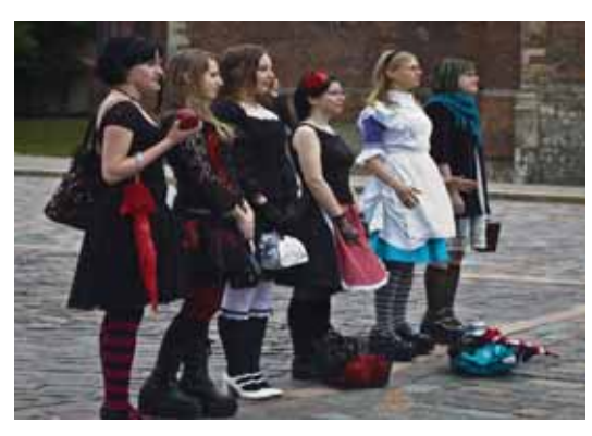
Pict. 25. Lolita Fairytale gathering, June 2009, Riga.