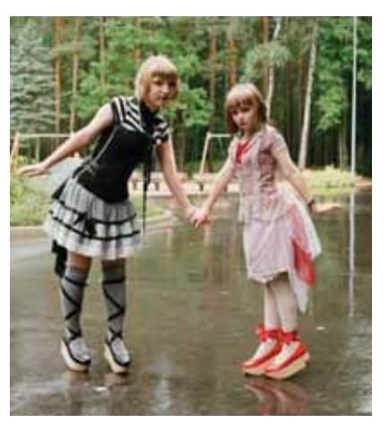
Pict. 31. Circus Lolita meeting, September 2010, Mežaparks (Forest park), Riga