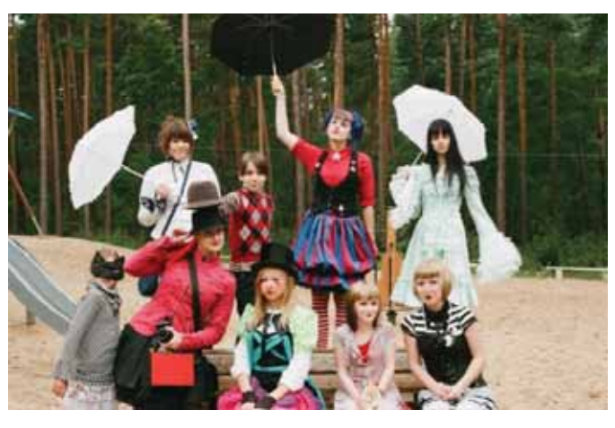
Pict. 27. Circus Lolita meeting, September 2010, Mežaparks (Forest park), Riga, Lauma Vāvere photo collection

Pict. 29. Circus Lolita meeting, with 100 years old top hat, Mad Hatter, September 2010, Mežaparks (Forest park), Riga, Lauma Vāvere photo collection