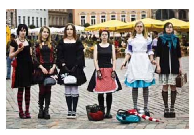
Pict. 23. Lolita Fairytale gathering, June 2009, Riga.