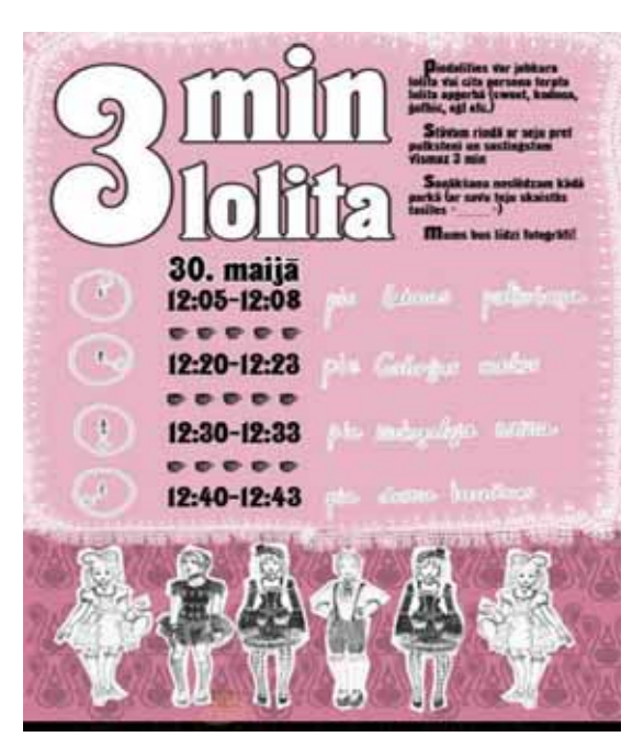
Pict. 17. Poster for 3 min Lolita gathering, May 2009, Riga, drawn by Lauma Vavere. "Any kind of Lolita can participate: Sweet, Kodona , Gothic, Ouji etc. Let's stand in a line facing the clock and freeze for 3 minutes. Let's conclude the meet-up in some park (with your own tea in a beautiful cup). Photographers will come!"