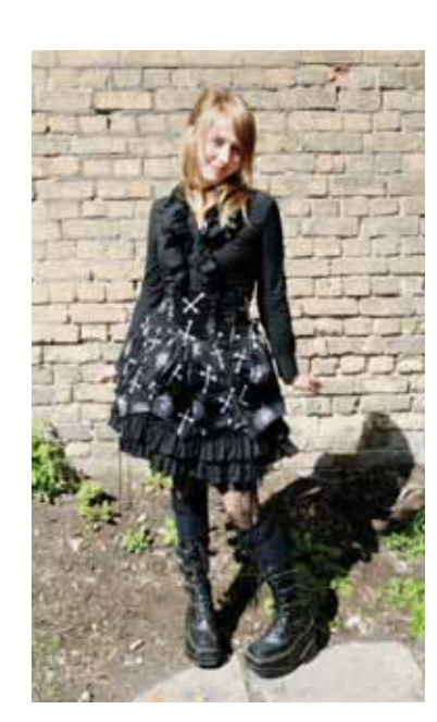
Pict. 14. Lolita gathering, August 2008, Riga.