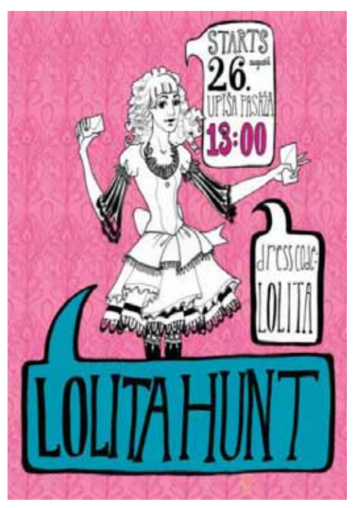
Pict. 12. A poster drawn by Lauma Vāvere, inviting for Lolita meet-up.