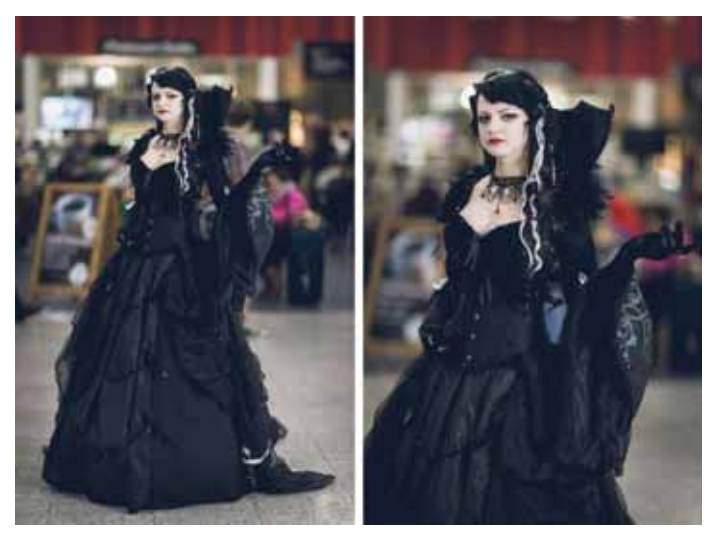
Pict. 42. Vampire costume, cosplay, 2012