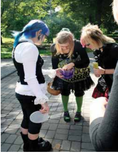
Pict. 16. Lolita gathering, August 2008, Riga. Lauma Vāvere photo collection