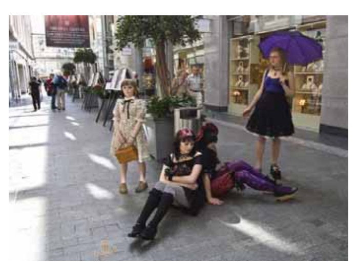
Pict. 19. 3 min. Lolita gathering, May 2009, Riga.