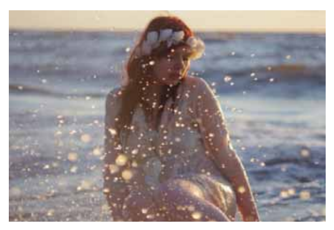
Pict. 54. Mori (Forest) Girl fashion, 2012, Zvejniekciems, Latvija.