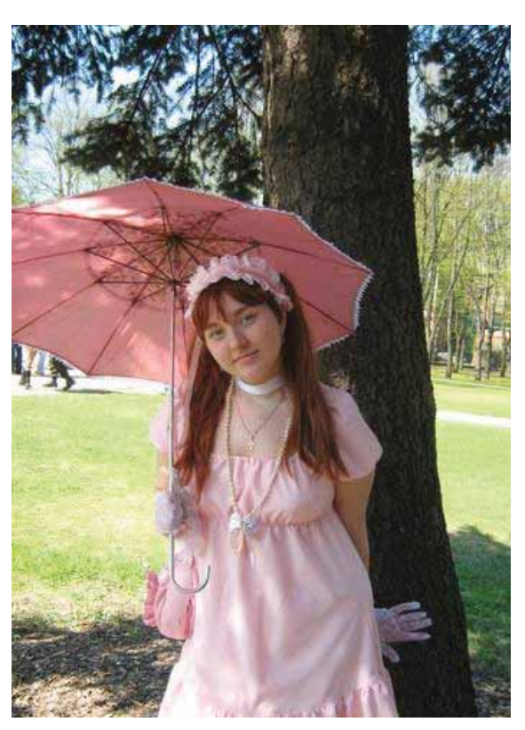
Pict. 46. Lolita dress, Ekaterina Horolska collection