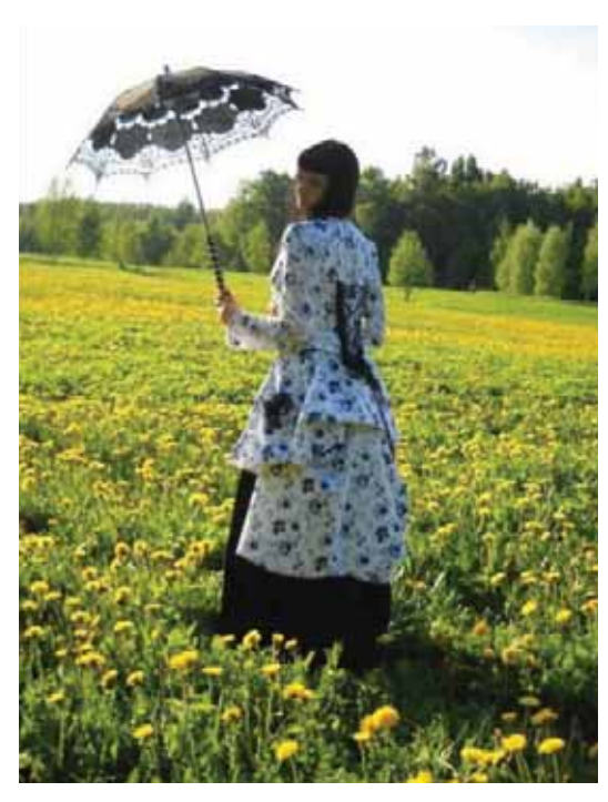
Pict. 41. "Lolita Dress", Latvia 2012