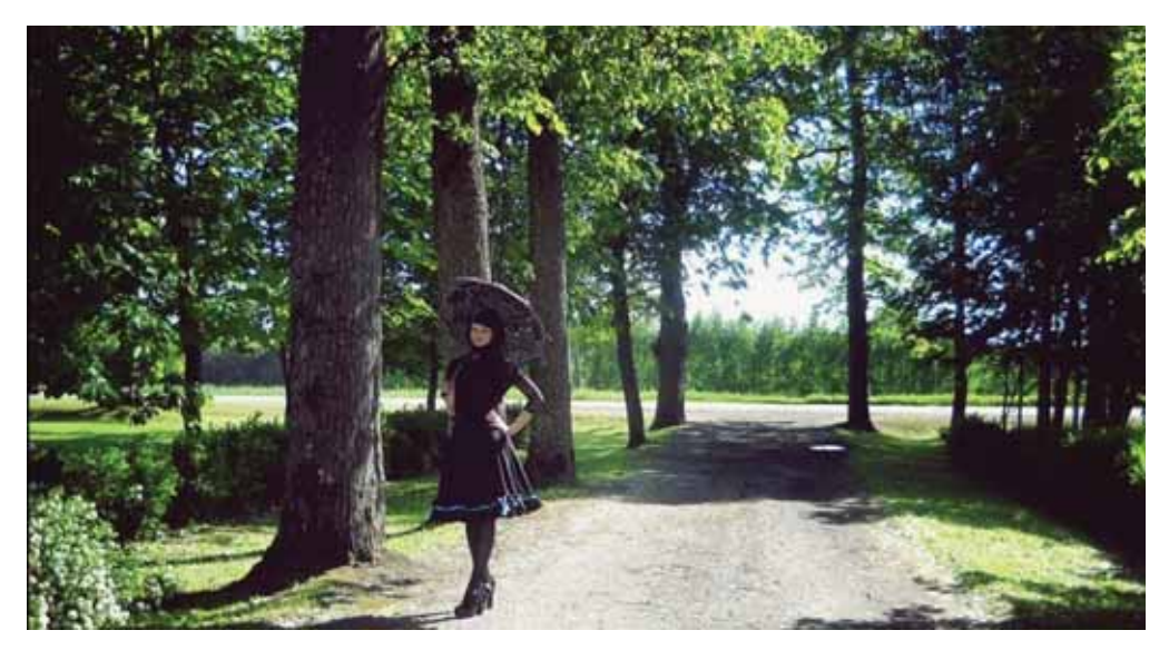
Pict. 3. "Black Lolita", Latvia 2012, design Darja des Mortes (internet name), picture collection of Darja des Mortes.