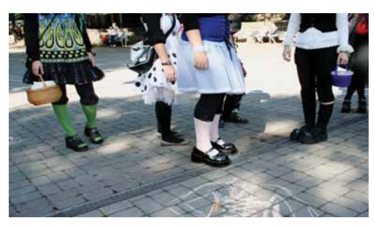
Pict. 13. Lolita gathering, August 2008, Riga.