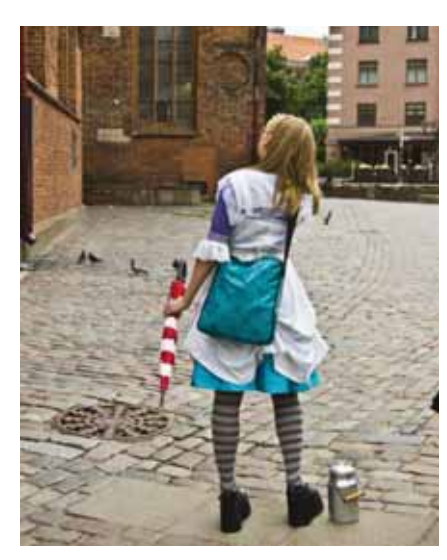
Pict. 22. Lolita Fairytale gathering, June 2009, Riga.