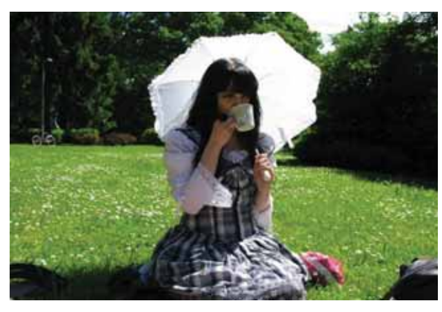
Pict. 35. Lolita meet-up "Picnic 2010, Riga, Latvia, Lauma Vāvere photo collection