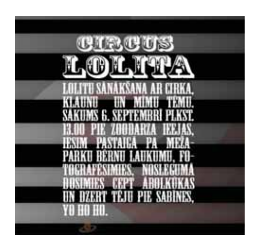
Pict. 26. A poster inviting to Circus Lolita meeting, 2010, drawn by Lauma Vāvere. " Lolita meet-up with Circus theme. Beginning in September 6th 13:00 in front of the Zoo, let's go for a walk in the Mežaparks (Forest) park, to the children playground, let's take pictures. At the end we will go to bake apple cakes and drink tea in Sabine's home. Yo Ho Ho.