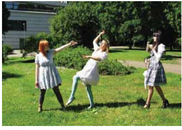
Pict. 37. Lolita meet-up "Picnic 2010, Riga, Latvia, Lauma Vāvere photo collection