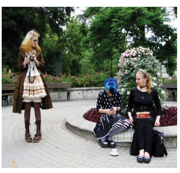
Pict. 9. Lolita Tea Party, 2008, Riga, Latvia