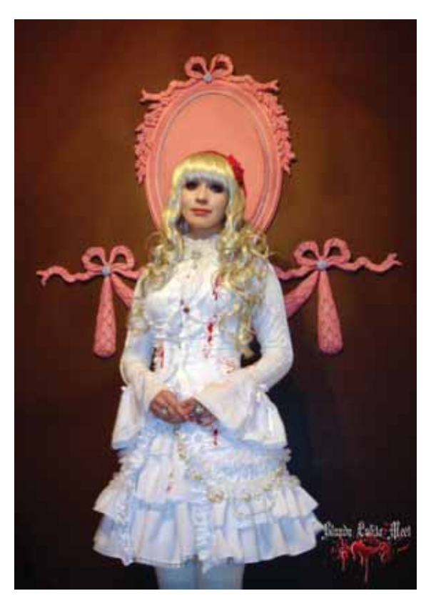
Pict. 39. Bloody Lolita meet-up, 2011