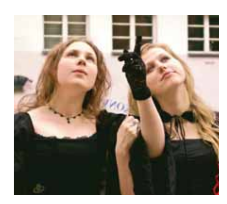
Pict. 24. Lolita Fairytale gathering, June 2009, Riga.