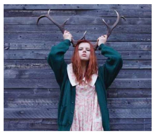
Pict. 51. Mori (Forest) Girl fashion, 2012, Latvija.