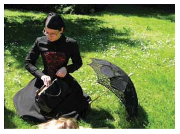
Pict. 36. Lolita meet-up "Picnic 2010, Riga, Latvia