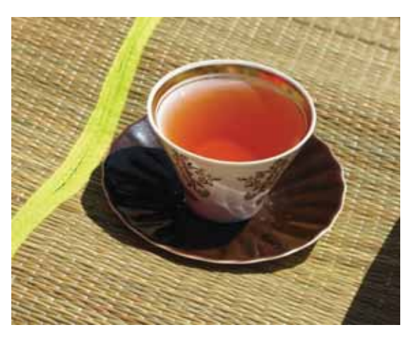
Pict. 33 Lolita meet-up "Picnic 2010, Riga, Latvia