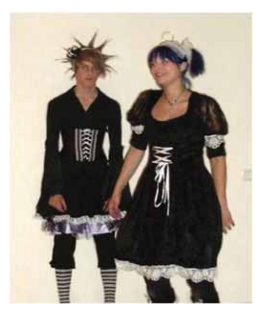
Pict. 6. Lolita meet-up 2006