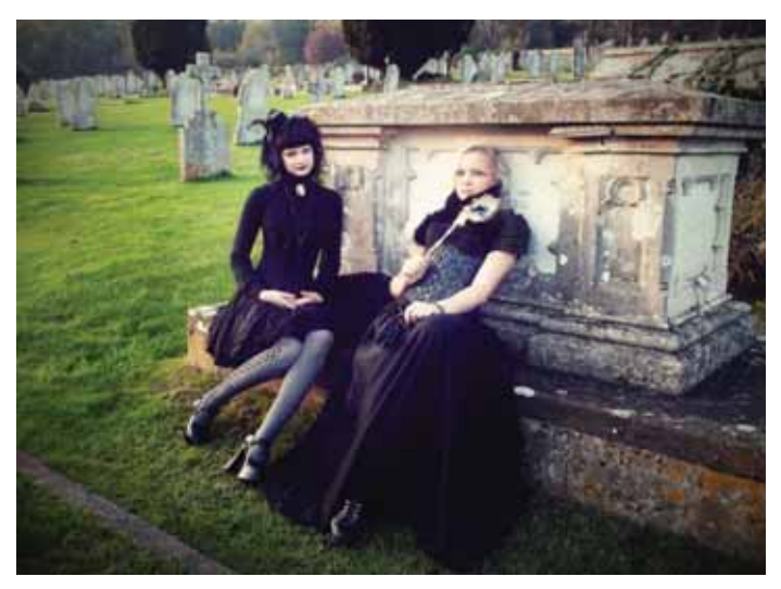
Pict. 43. Classic Gothic Lolita costumes (featuring thrown away dolls)