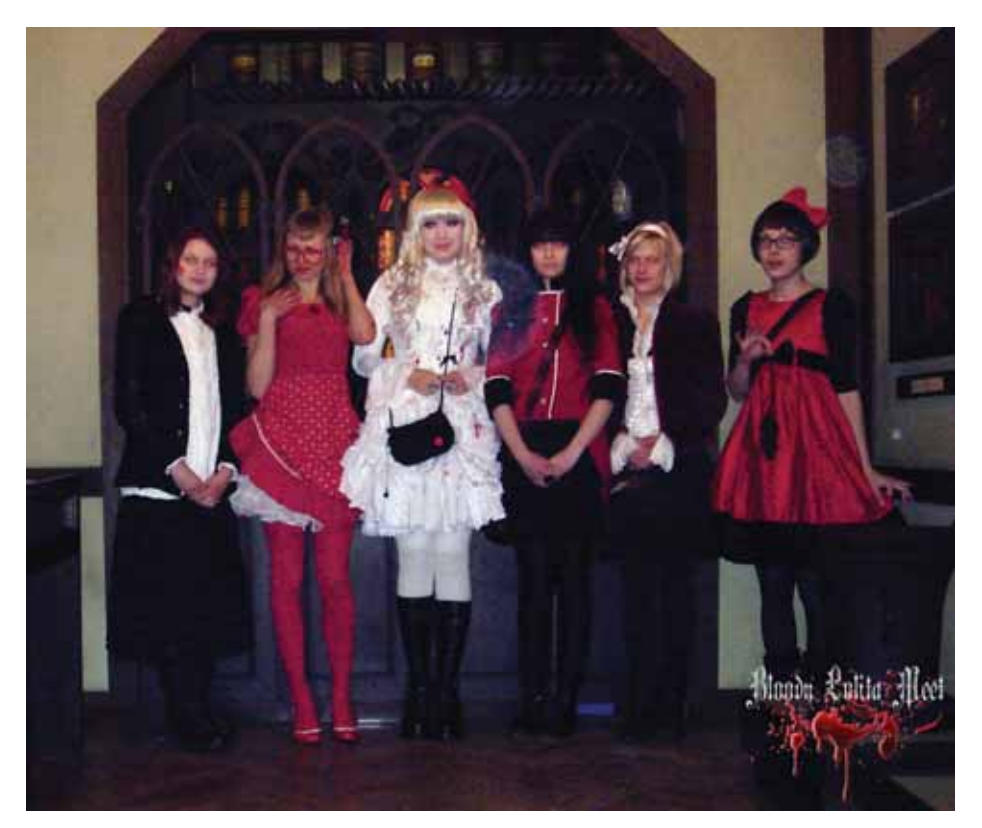
Pict. 38. Bloody Lolita meet-up, 2011