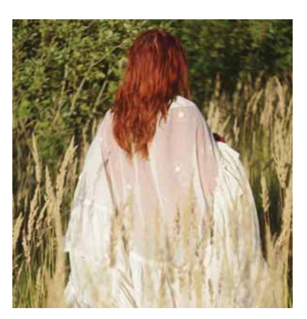
Pict. 53. Mori (Forest) Girl fashion, 2012, Latvija.