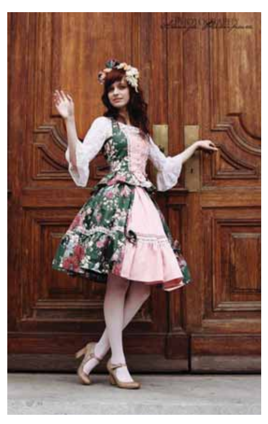
Pict. 2 . "Rococco Inspired Classic Lolita", designer Lauma Vāvere, 2012, Bīriņi castle, Latvia, photo collection of Lauma Vāvere.