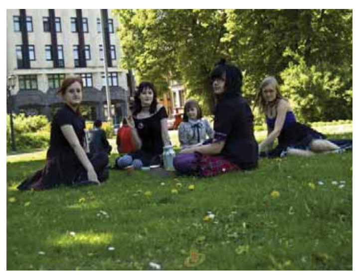
Pict. 18. 3 min. Lolita gathering, May 2009, Riga.