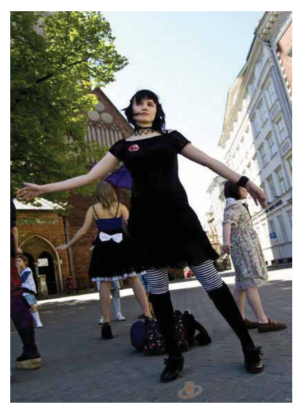
Pict. 20. 3 min. Lolita gathering, May 2009, Riga.