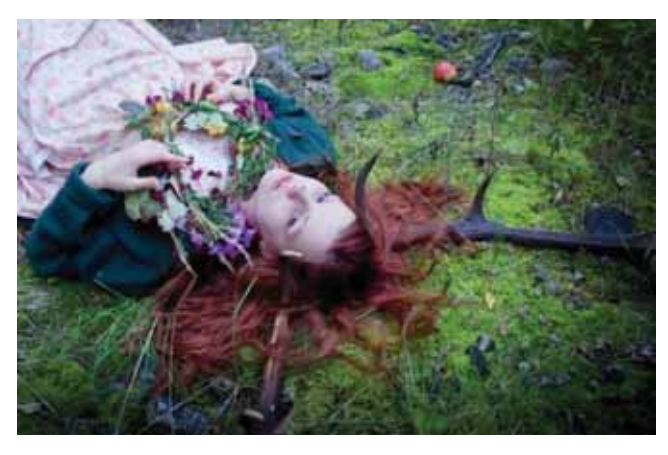
Pict. 52. Mori (Forest) Girl fashion, 2012, Latvija.