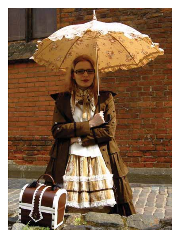
Pict. 10. Lolita Tea Party, 2008, Riga, Latvia