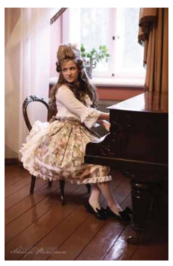
Pict. 1. "Rococco Inspired Classic Lolita", designer Lauma Vāvere, 2012, Bīriņi castle, Latvia, photo collection of Lauma Vāvere.