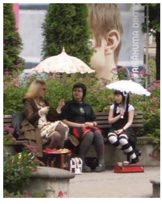
Pict. 8. Lolita Tea Party, 2008, Riga, Latvia