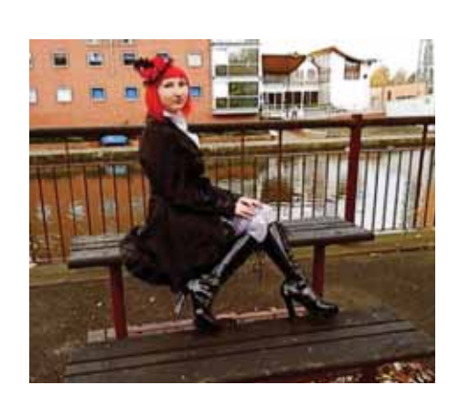
Pict. 45. Lolita costume, Egija Medne collection