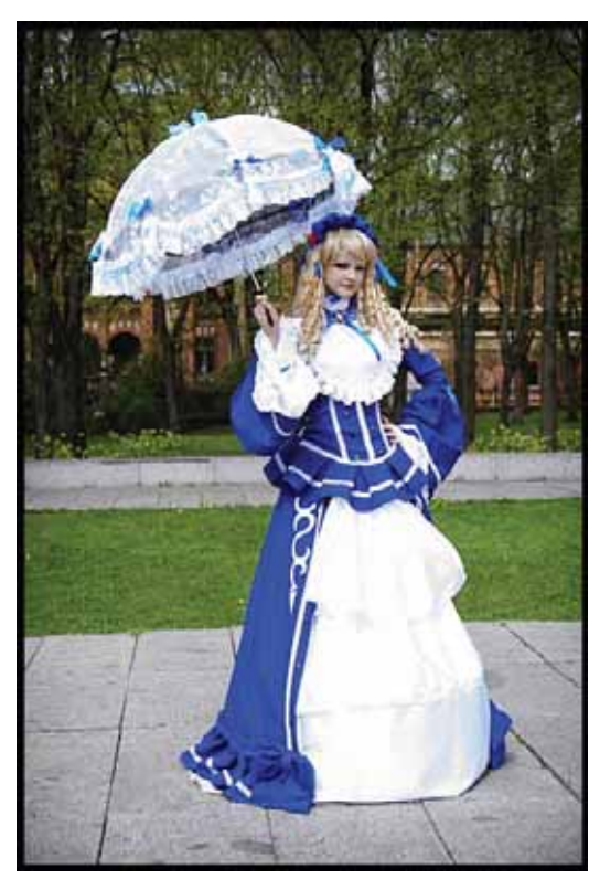
Pict. 49. Le Chevalier d'Eon , Darja des Mortes photo collection