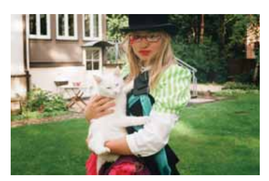
Pict. 28. Circus Lolita meeting, with 100 years old top hat, Mad Hatter, September 2010, Mežaparks (Forest park), Riga