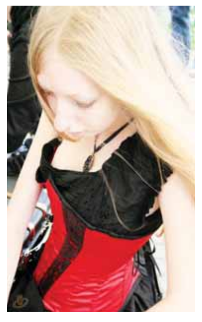
Pict. 15. Lolita gathering, August 2008, Riga.