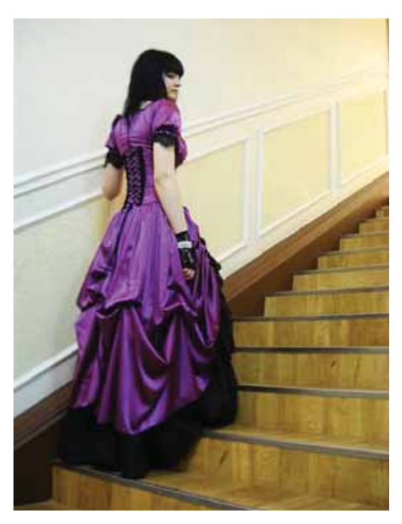
Pict. 44. Lolita costume