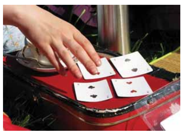
Pict. 34. Lolita meet-up "Picnic 2010, Riga, Latvia